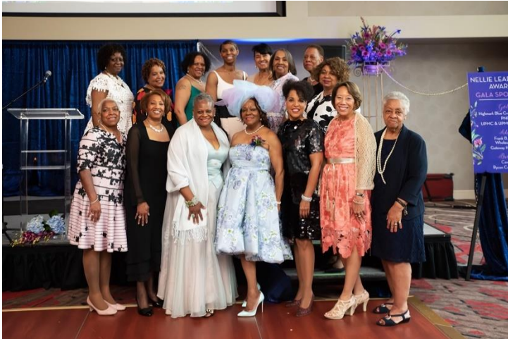
Supporters Alpha Kappa Alpha Sorority, Incorporated.